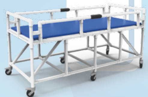
BRM 001 B

The BRM 001 non-magnetic patient trolley is also available in a bariatric version BRM 001 B: increased width, 6 casters (4 with total-lock brake), a thicker deck and a higher density mattress allow to support up to 250 kgs.